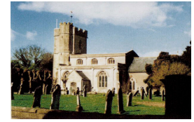
St Mary's Church, Meare