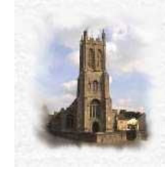
St Benedict's Church