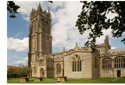
St John's Church